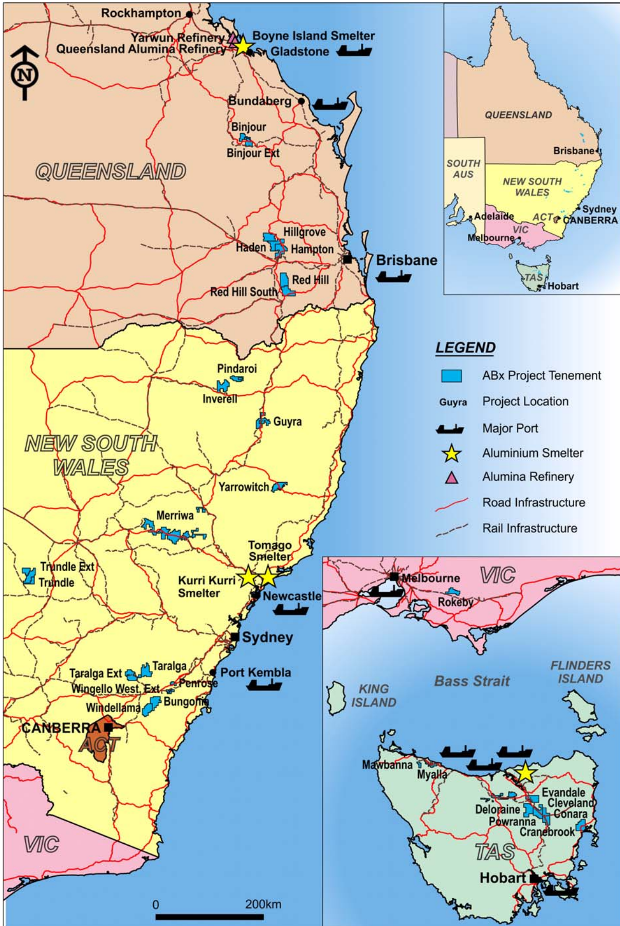
Figure 4: ABx Project Locations