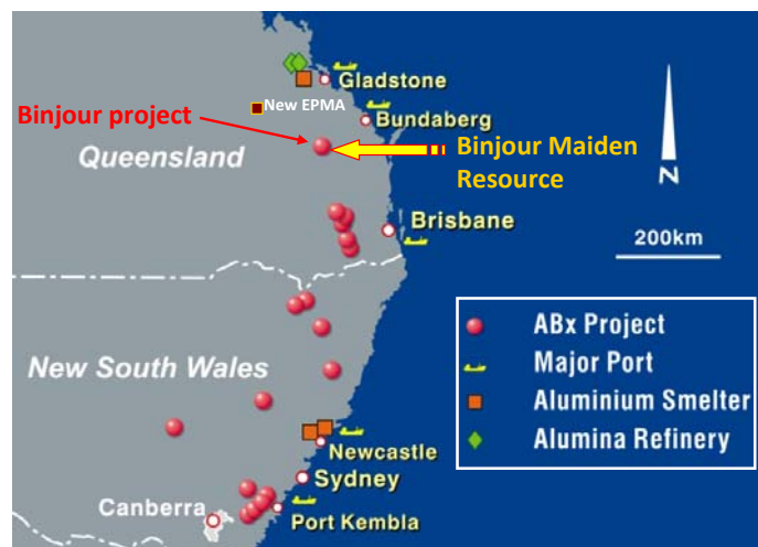
Figure 1: Location

New areas of bauxite have been discovered in recent months and are currently being drilled to expand resource extent.