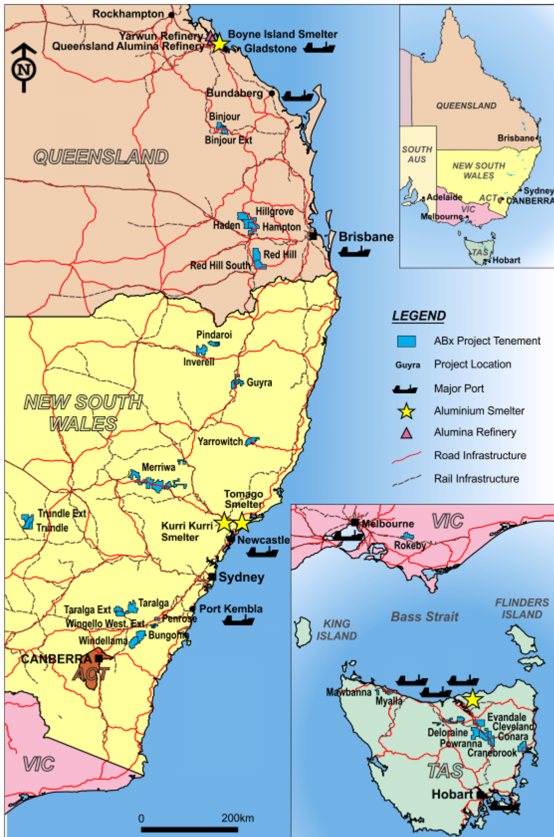
ABx Project Tenements and major infrastructure – January 2011